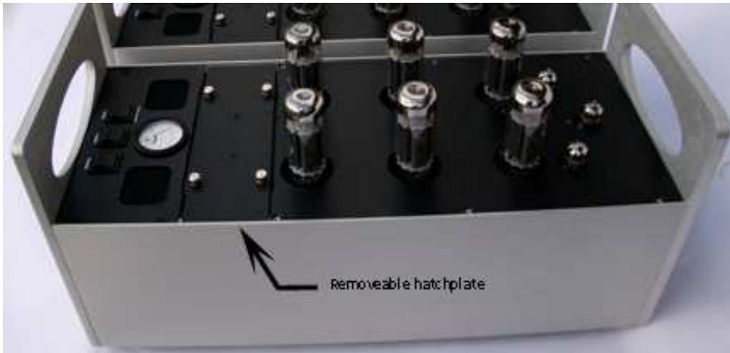
Figure 2. Removable hatchplate