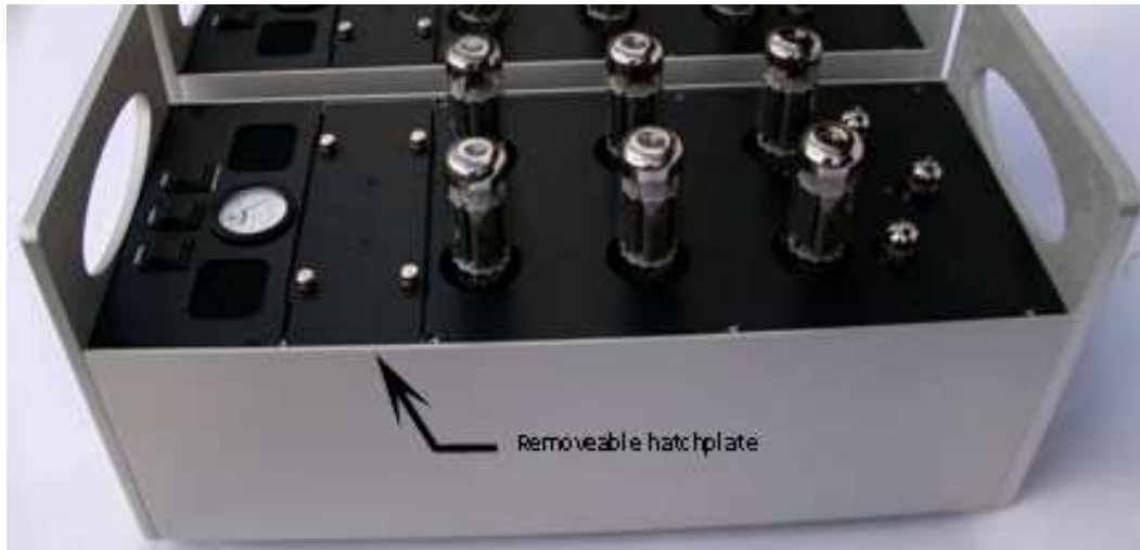
Figure 2. Removable hatchplate