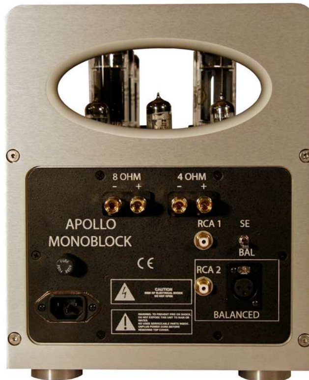
Figure 1. Rear panel layout

Note that a second preamplifier or home theater processor can be connected to the second set of RCA outputs.